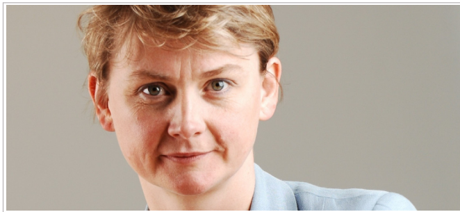
Yvette Cooper Secretary of State for Work and Pensions

“We will not stand by and let young people get left behind in this recession. We are investing around £1 billion in getting young people and the long term unemployed jobs and opportunities to make the most of their talents and skills.”